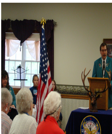
FLAG DAY - 2011